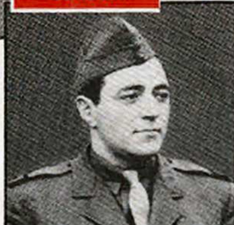
LARRY LESUEUR went from Paris to London in troopship, covers the British front